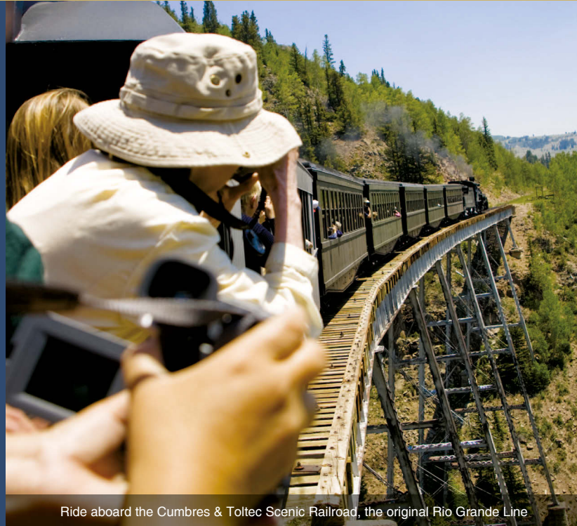
Ride aboard the Cumbres & Toltec Scenic Railroad, the original Rio Grande Line