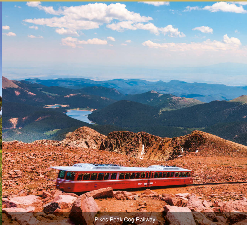
Pikes Peak Cog Railway

fired, steam-operated and are maintained in their original condition. Later, check into the Sky Ute Casino Resort where you may wish to give “Lady Luck” a try. Meals: B, D